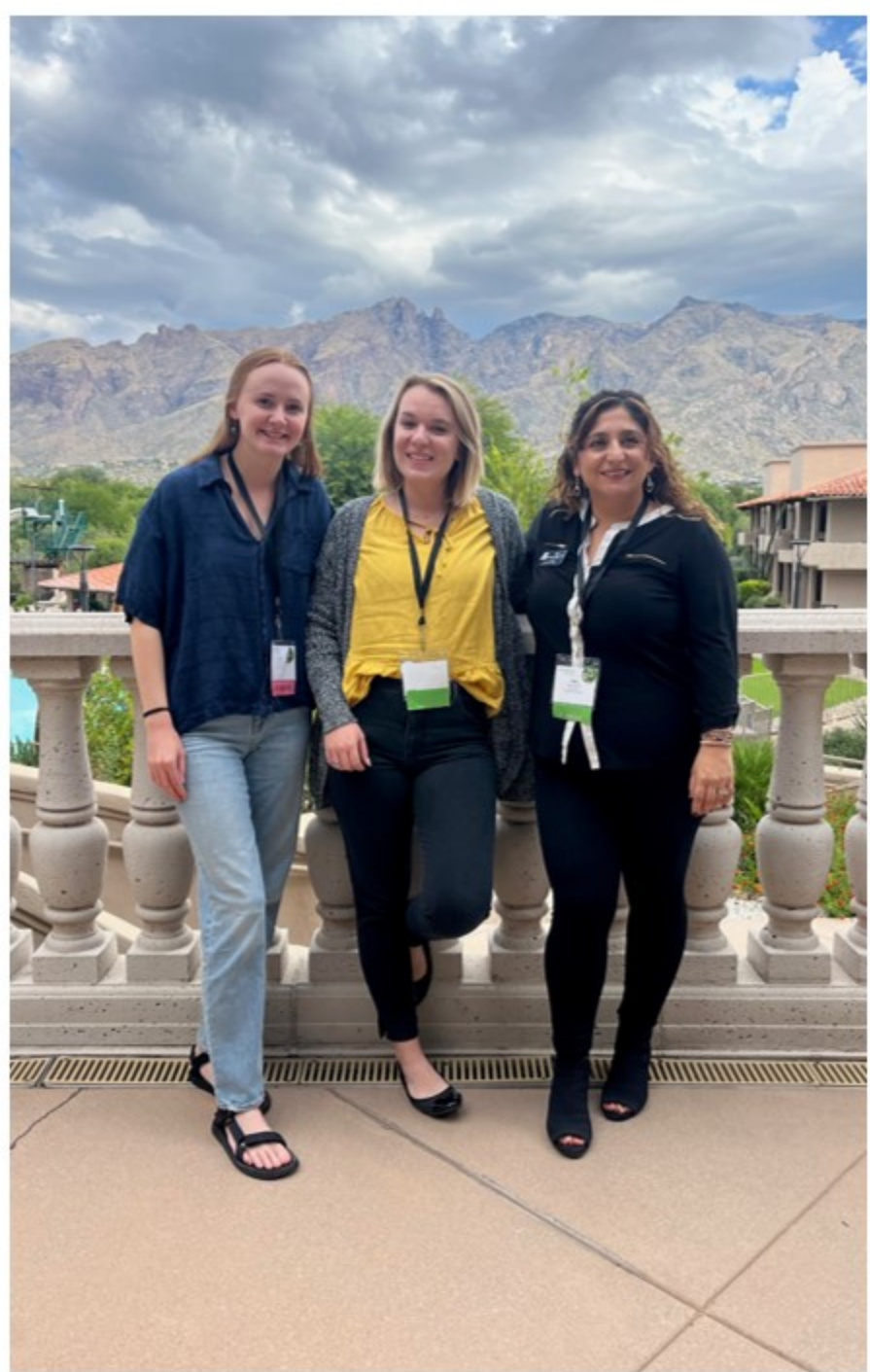
North American Association for Environmental Education Conference