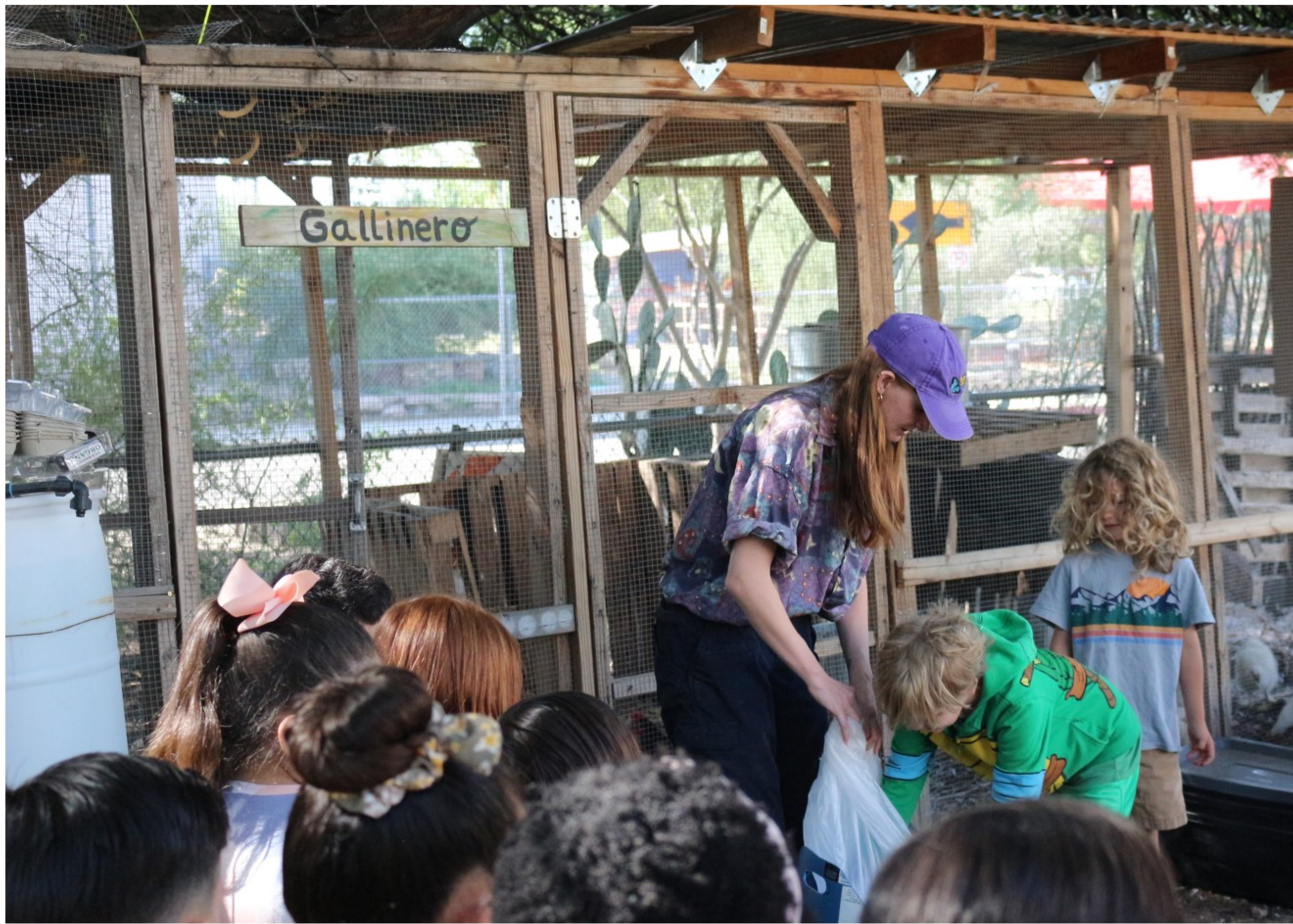
Building a vermicompost with 2 nd graders at Davis Bilingual Elementary

“Close your eyes and imagine you are a worm...”