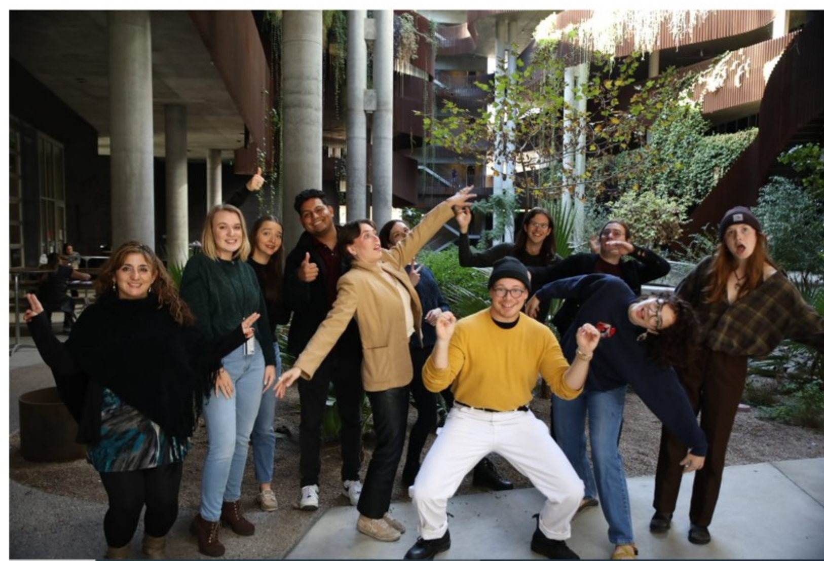
Compost Cats Team End of Year Gathering 2022